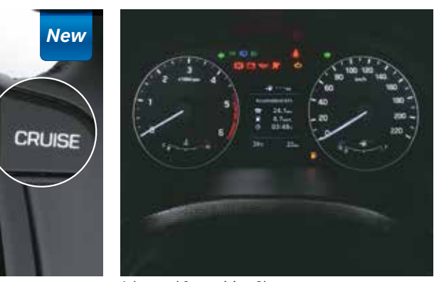
Advanced Supervision Cluster