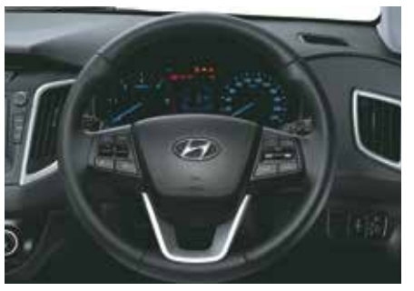
Leather Wrapped Steering with Contrast Stitching & Silver Colour Garnish