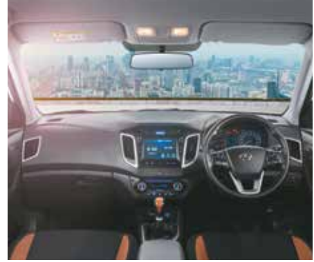
Sporty Interior Colour Pack *

**Leatherette *Available in SX Dual Tone Variant Only "Availabe in SX AT only