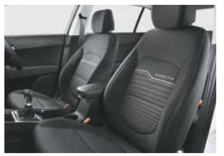
Black Seat Fabric with CRETA Embossing