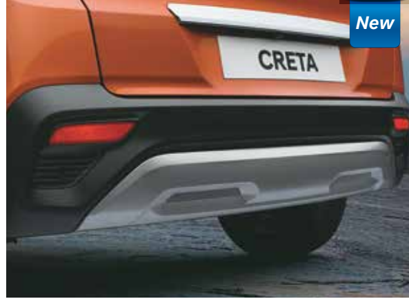
Bold Front & Rear Skid Plates