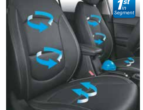
Front Ventilated Seats