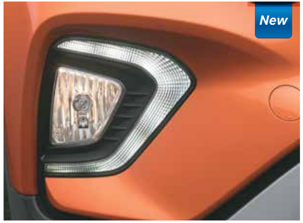
LED DRL & Positioning Lamp