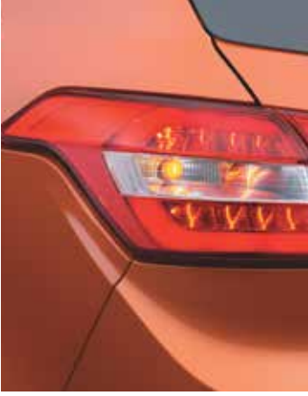
Stylish Split LED Tail Lamps

Shark Fin Antenna | Chrome Finish Outside Door Handles | Sporty Dual Tone Exterior Colours LED Turn Indicator on ORVMs | Side Body Cladding