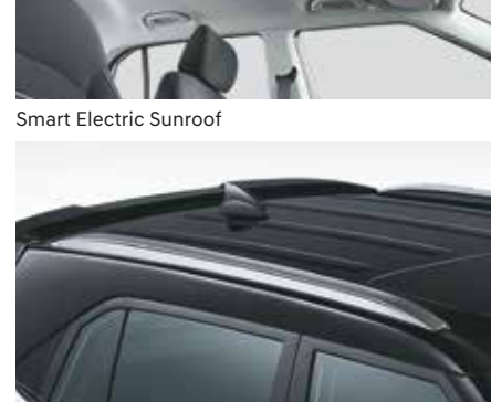
New Silver Colour Finish Roof Rails