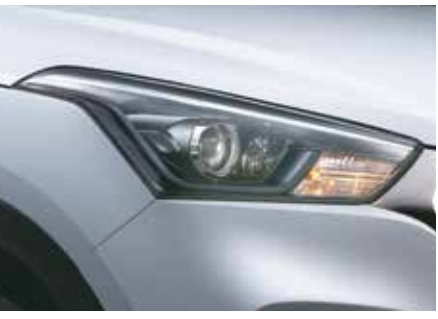
Smoked Bi-Functional Projector Headlamps