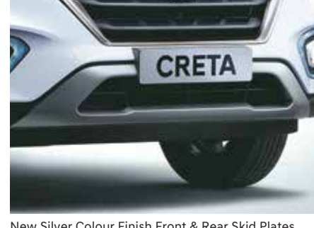
New Silver Colour Finish Front & Rear Skid Plates