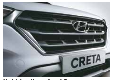
Black & Dark Chrome Front Grille