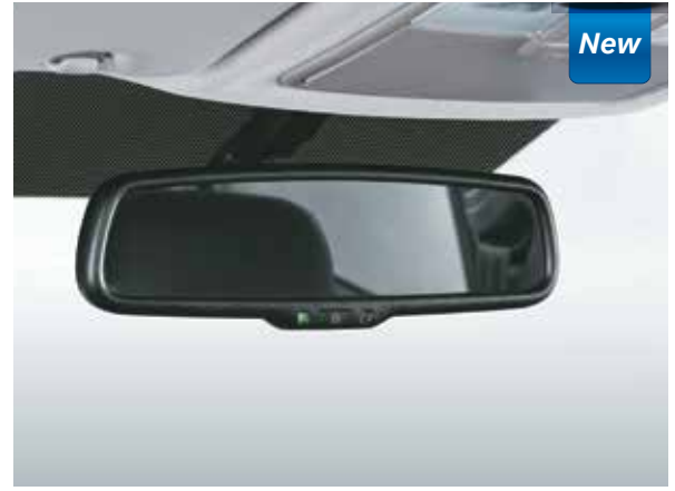
Electrochromic Mirror (ECM)