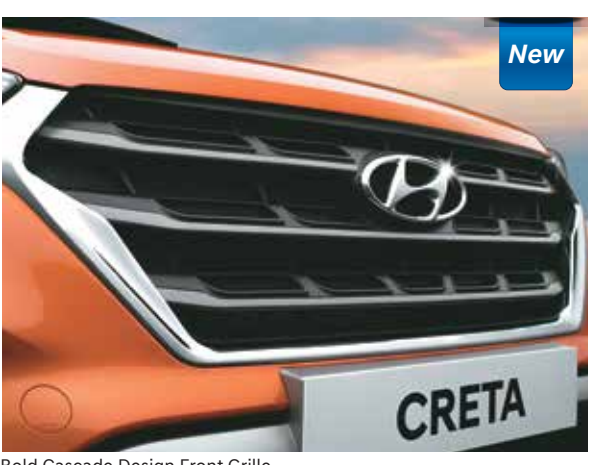
Bold Cascade Design Front Grille

Designed to turn heads as effortlessly as it turns corners, the CRETA is crafted beyond perfection. Based on Hyundai's evolved Fluidic Sculpture 2.0 design concept, it always arrives in style and leaves a strong impression.