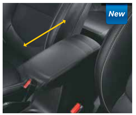
Sliding Front Armrest