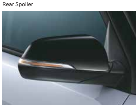
Black Colour ORVM

R17 Diamond Cut Alloys | Chrome Dual Faux Exhaust | Body Colour Rear Garnish TGS Gaitor Boot with Contrast Stitching 🔰 New Silver Colour Finish Console Upper Cover, Inside Door Handles