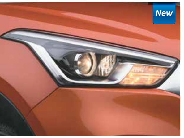
Bi-functional Projector Headlamps