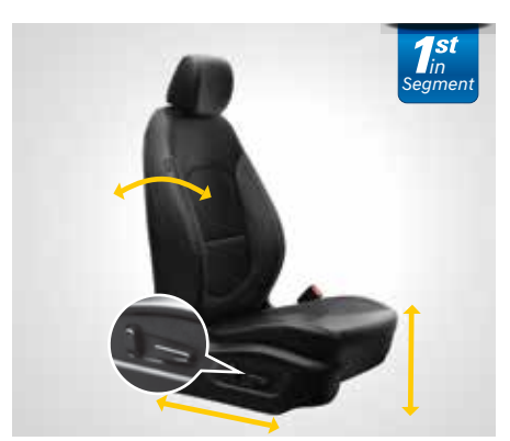
6 Way Power Driver Seat