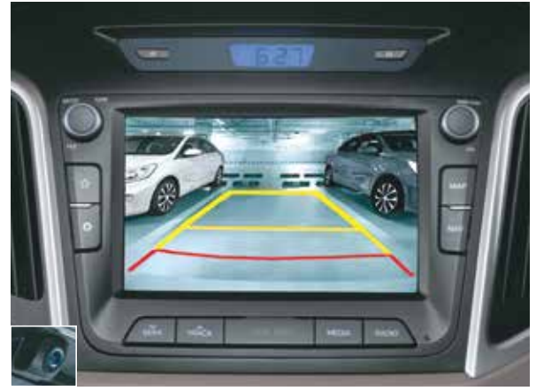
Rear Parking Assist System