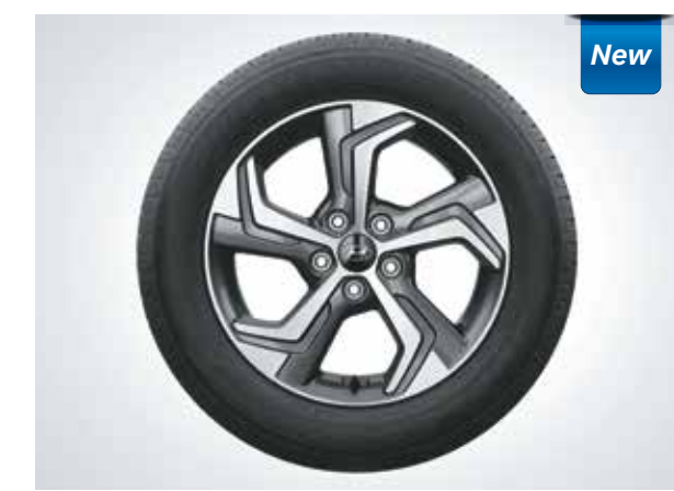
R17 Diamond Cut Alloys