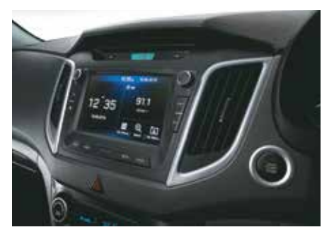
New Silver Colour Front & Rear AC Vents